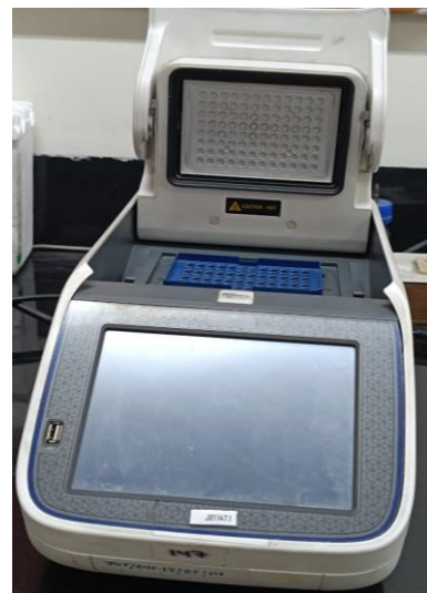
Polymerase Chain Reaction (PCR) Unit