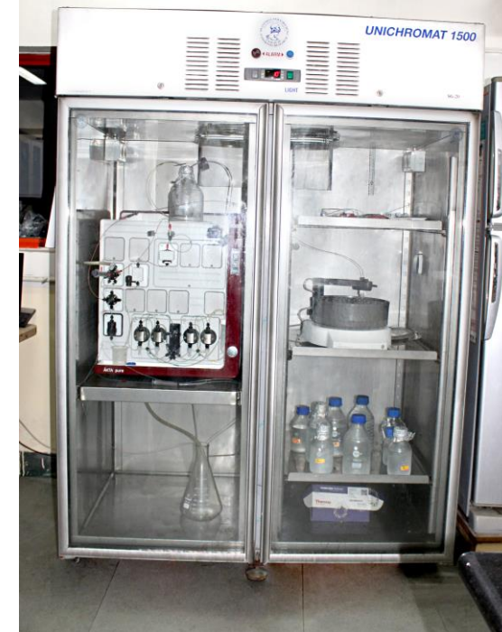
HPLC with sample collector