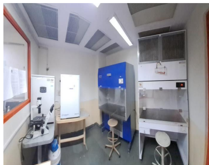
Cell Culture Lab