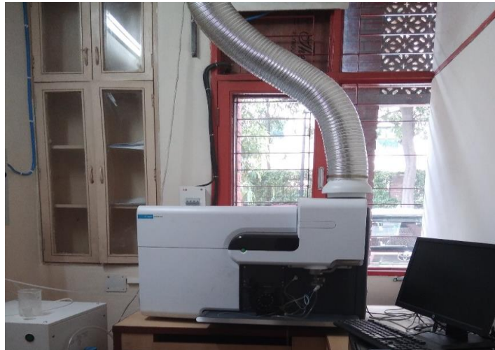
MP-AES Microwave Atomic Emission System