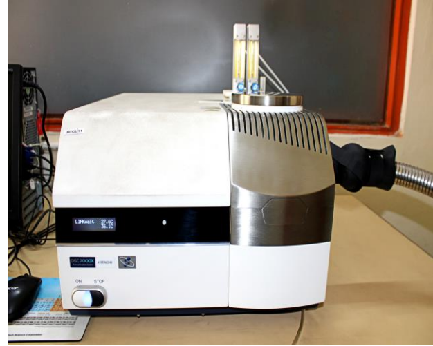
Differential Scanning Calorimeter