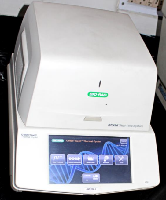
Real Time PCR