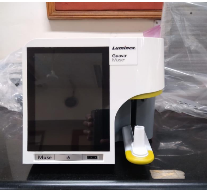
Muse Cell Analyzer